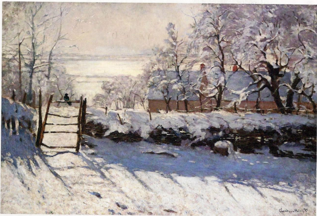
The Magpie, 1869, Claude Monet, Musée d'Orsay, Paris, France

▲ Critical Viewing Compare and contrast the artist's concept of winter with Updike's. [ Compare and Contrast ]