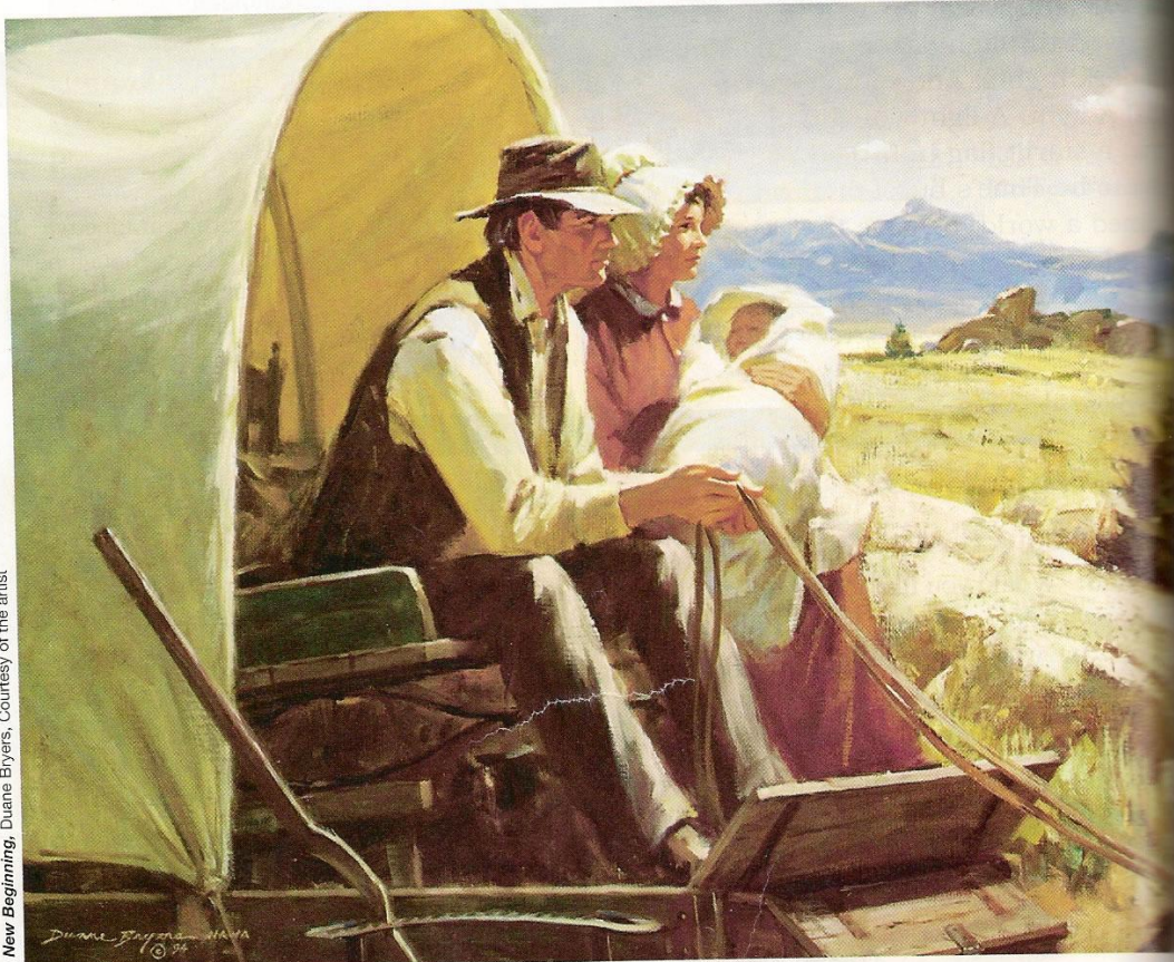
A New Beginning, Duane Byers, Courtesy of the artist

▲ Critical Viewing What do the expressions on the faces of the couple in the painting reveal about their emotions? [Infer]